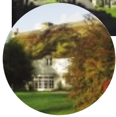
Left: Cottages at Merthyr Mawr

7 St. Teilo's Church ⑤ dates back to the middle of the 19th Century, and was built on an ancient site. Indeed stones have been found dating from the 5th Century suggesting there was an important Christian cemetery here.