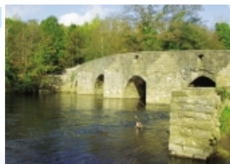
New Inn (dipping) bridge, Merthyr Mawr

road, carry straight on down the hill (you will come to a point where you see a footpath sign on your right hand side pointing up a rough track. This is a link into the Bridgend Circular Walk heading towards Laleston). To continue the walk follow the road downhill towards Home Farm. At Home Farm, cross the stone stile on the right and cross a small field. Go over a wooden stile through a small wooded area and over another stone stile to come out on the road.