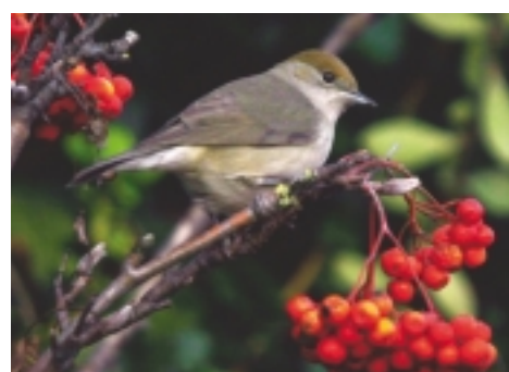
Female Black cap (NB The male has the black cap)

Keeping the river on your left continue along the path passing the tennis club on your right hand side along Church Road. Go through the subway where you will come out on Merthyr Mawr Road.