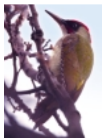
Green Woodpecker

Follow the road using the pavement where possible passing the church on your right hand side. When you get to the end of the road turn left - you are now on Nolton Street. Continue along the pavement then cross at the pedestrian crossing and retrace your steps to the railway station.