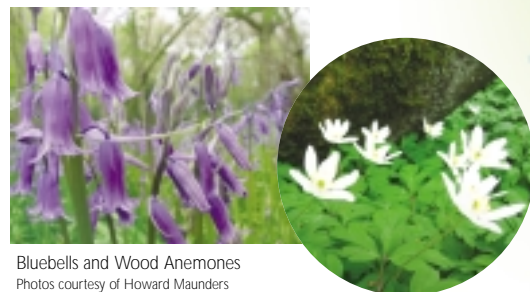
Bluebells and Wood Anemones

This wood saves lives! Imagine how uncomfortable life would be without food or shelter. Craig y Parcau provides these essentials for all sorts of animals and birds. In season you can hear Song Thrush, Blackcap and Chiffchaff. You may possibly also see and hear Green Woodpecker. In the spring the reserve supports lots of woodland flowers such as bluebell, wood anemone and yellow archangel which would suggest that this area has been woodland for a long time. It's now being run as a Local Nature Reserve to ensure that wildlife continues to thrive here.